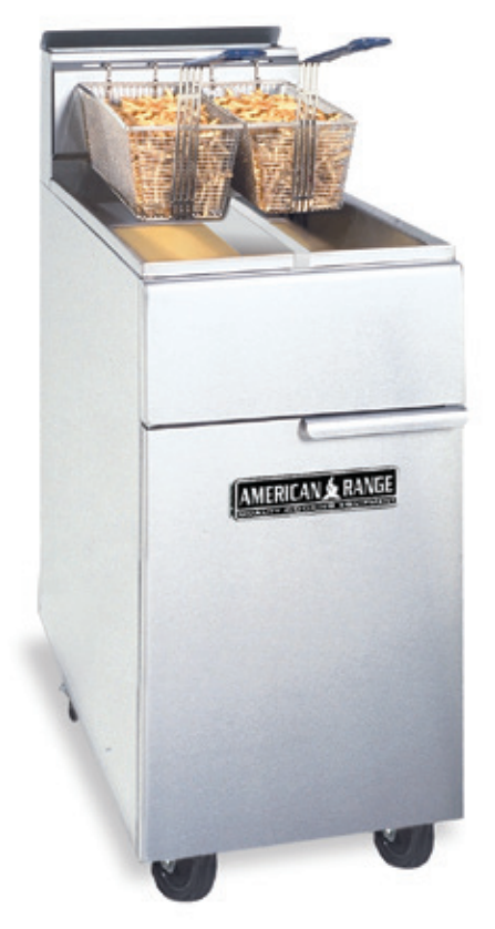
AF-25/25 Shown with optional casters