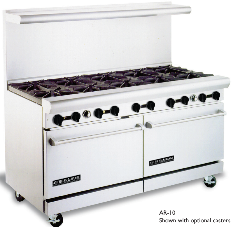
AR-10 Shown with optional casters