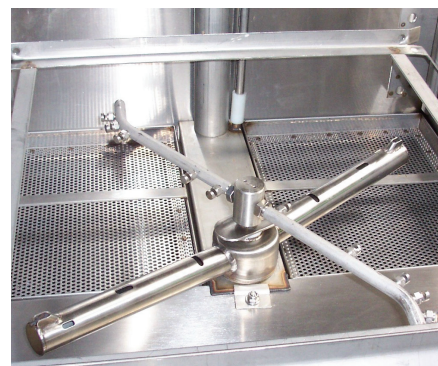
Separate Wash and Rinse Arms are designed for optimum cleaning and sanitation.