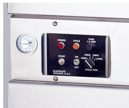
Simple controls are water resistant and flush mounted on unit front.