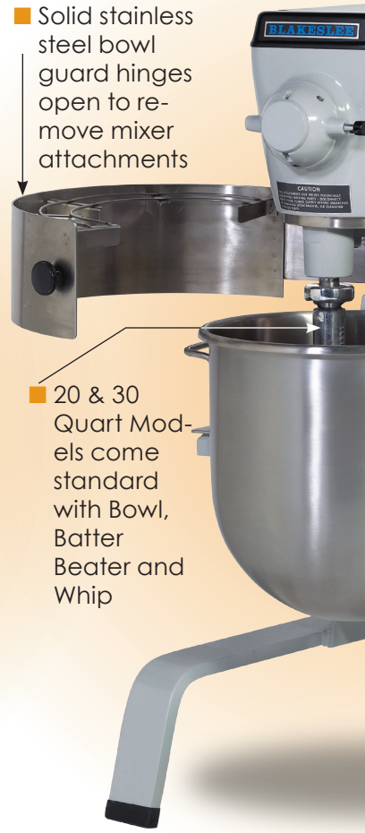
Model F-30 30 Quart Floor Mixer

■ 20 & 30 Quart Models come standard with Bowl, Batter Beater and Whip