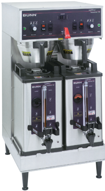
Model Dual SH with 1.5 gallon SH Servers (servers sold separately)

Dimensions: 35.8" H x 18" W x 20.5"D (91cm H x 45.7cm W x 52.1cm D)