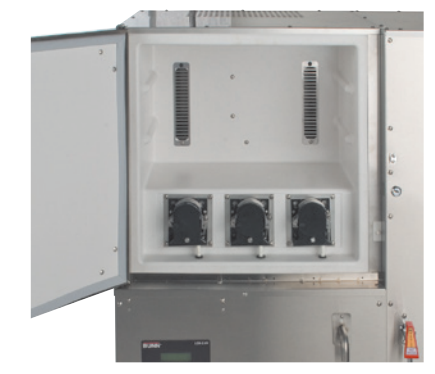
BIB compartment view

250ml Graduated Cylinder Product No.: 34028.0000 For use in calibration of pumps.