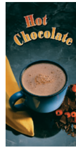
Model FMD-1 available with optional Hot Chocolate Display