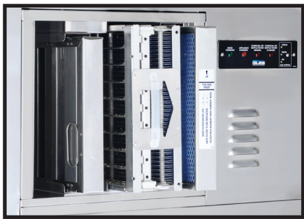
Ventless Filters • Baffle grease filter • Electrostatic filter • Polysorb filter