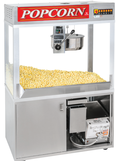
Mach 5 Floor Model (4 ft)