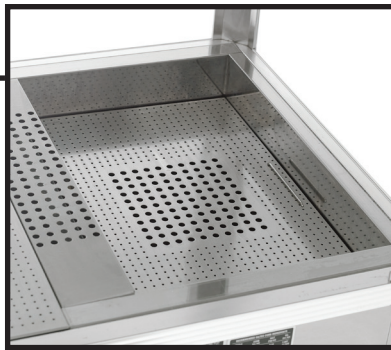
Bin Elevator (up)