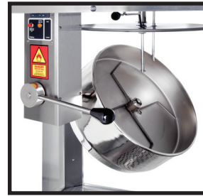
Mach 5 Kettle