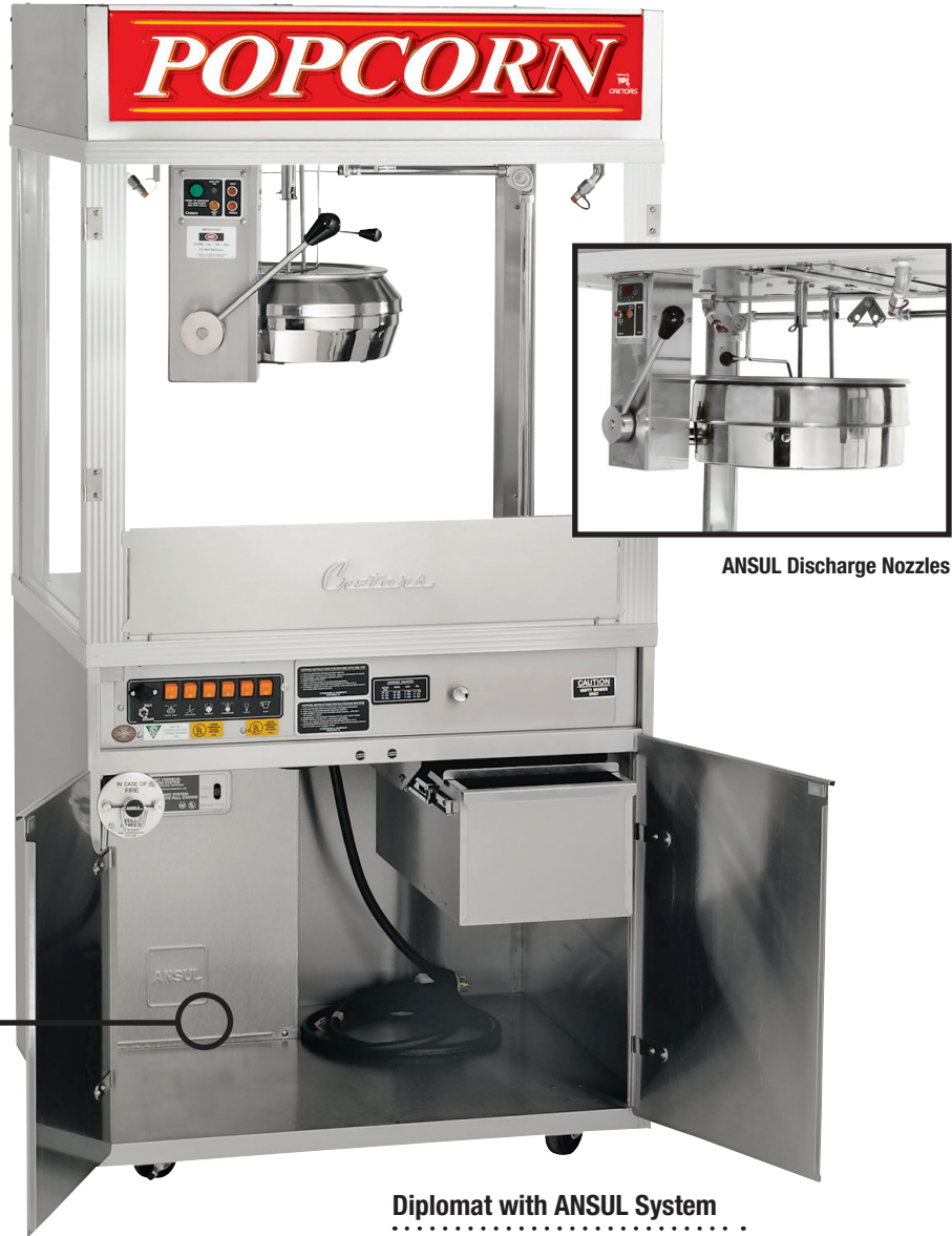
ANSUL Discharge Nozzles