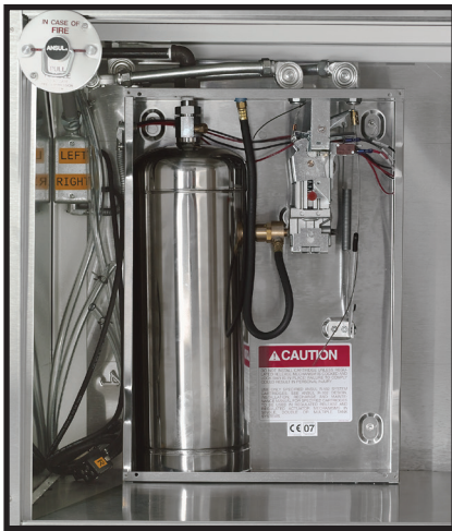
ANSUL canister inside base cabinet