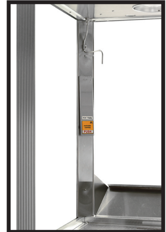
Popit N' Topit