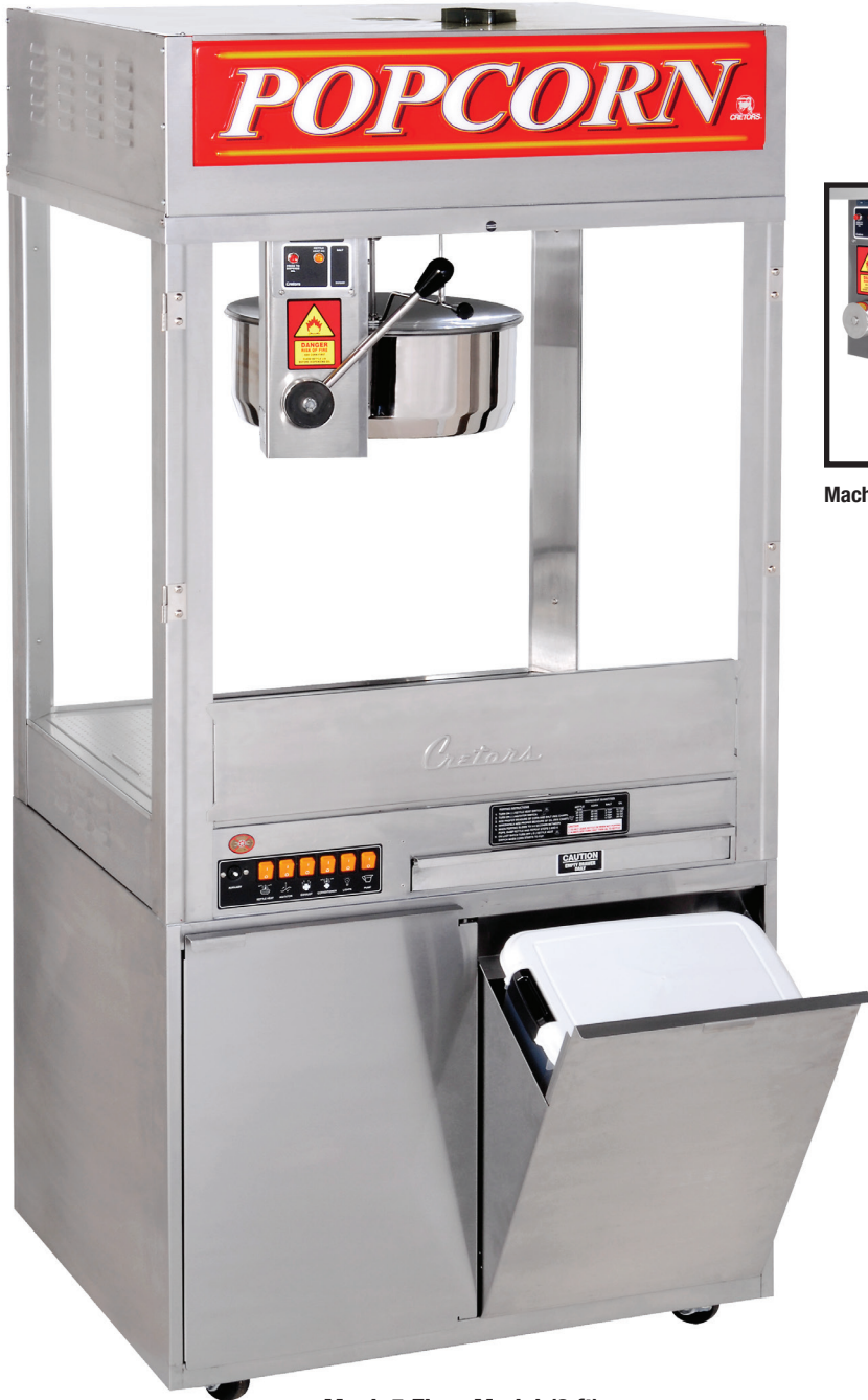
Mach 5 Floor Model (3 ft)

you to upgrade to a larger kettle. The large 16" diameter kettle allows for maximum expansion for today's high expansion corn hybrids. Need more volume? Turn your 32 oz kettle into a 48 oz or 60 oz by simply changing the heat elements. The current MACH 5 is the fifth generation of our popular popper, coupling Cretors expertise and all the benefits of modern manufacturing.