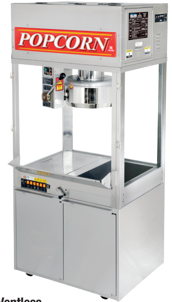
Mach 5 Ventless