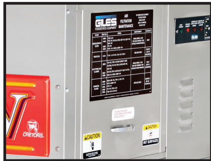
Close-up of Ventless Feature