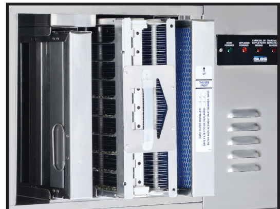
Ventless Hood System