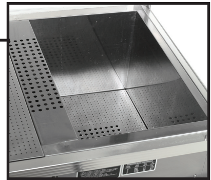
Bin Elevator (down)