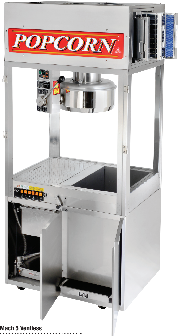
Mach 5 Ventless