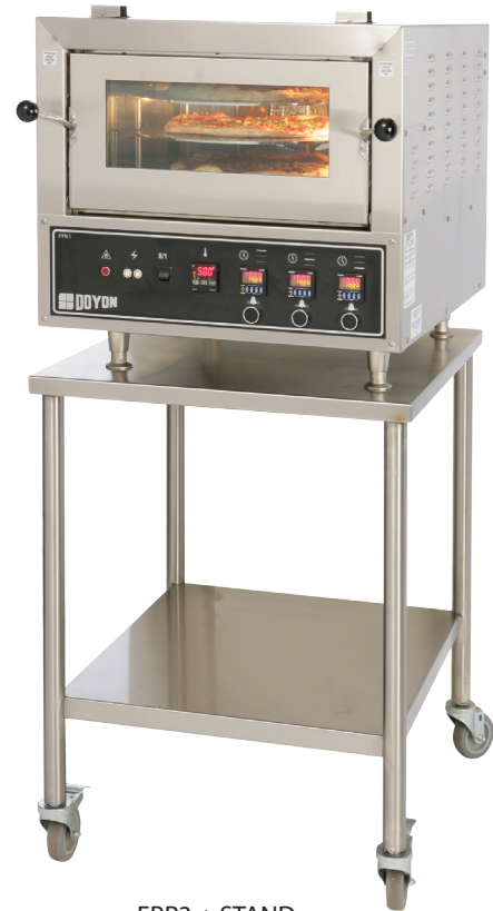
FPR3 + STAND

Bread, Rolls, Buns, Pastries, Cookies, Muffins, Pies, Cakes, Bagels, Croissants, Sourdough, Ryes, Pizza and Proteins