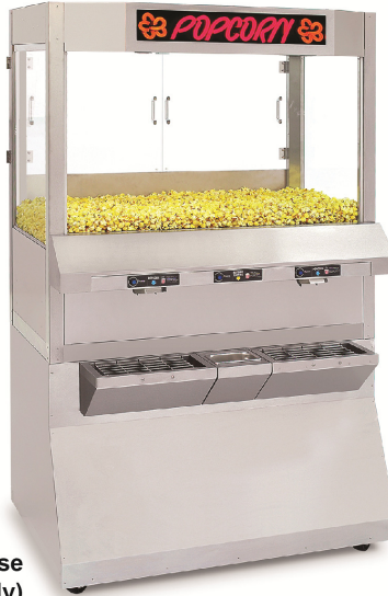
ReadyServe Unit on Base (items sold separately)