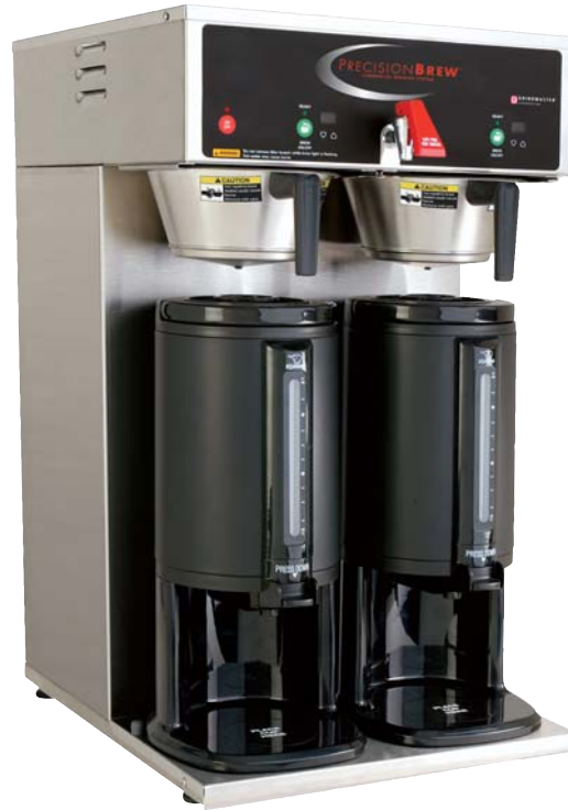
Model B-DGP (Containers sold separately)