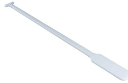
Paddle is included.