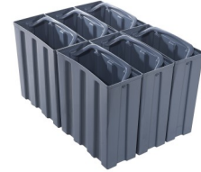
6 Bucket Kit sold separately.