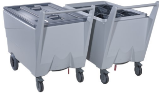
2 Easy Carts are included.