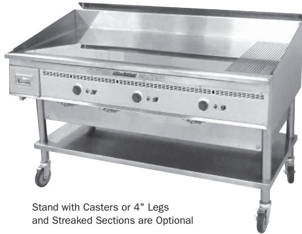
Stand with Casters or 4" Legs and Streaked Sections are Optional

The Keating MIRACLEAN® Griddle is designed to provide maximum performance with many benefits to the operator. The mirror surface is achieved in a special eight step process. High input burners rated at 30,000 BTU/hr. for natural gas are mounted every 12" to ensure performance and recovery allowing the operator to use zone cooking for different products.