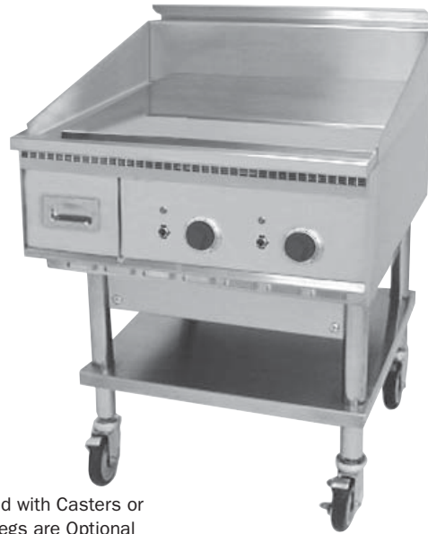
Stand with Casters or 4" Legs are Optional

The Keating MIRACLEAN® Griddle is designed to provide maximum performance with many benefits to the operator. The mirror surface is achieved in a special eight step process. Insulated stainless steel electric elements are mounted every 12" to ensure performance and recovery allowing the operator to use zone cooking for different products.