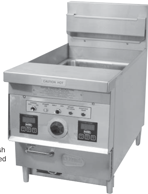
One pair 4 mesh baskets included

The 14 TS Counter Model Fryer is ideal for multi-product use. The 14 TS allows you to cook up to 72 lbs. of frozen french fries or 75 lbs. of chicken per hour with an input of 23.2 kW rated at 240 volts.