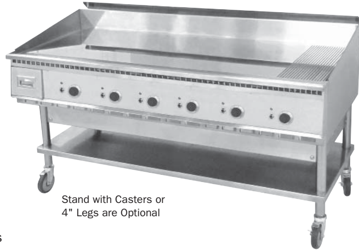
Stand with Casters or 4" Legs are Optional

The Keating MIRACLEAN® Griddle is designed to provide maximum performance with many benefits to the operator. The mirror surface is achieved in a special eight step process. Insulated stainless steel electric elements are mounted every 12" to ensure performance and recovery allowing the operator to use zone cooking for different products.