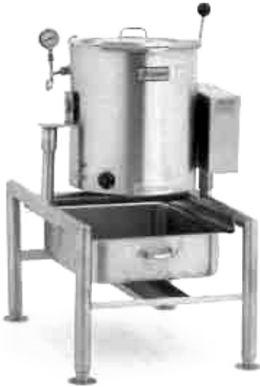
Model TEH-10F with optional lift-off cover