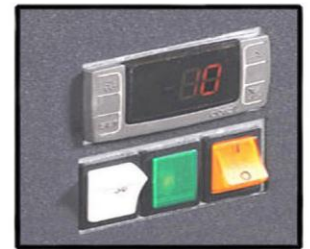
DIGITAL CONTROLLER WITH HIGH PRESSURE ALARM