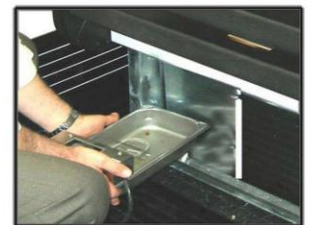
PULL OUT EVAP PAN FOR EASY CLEANING