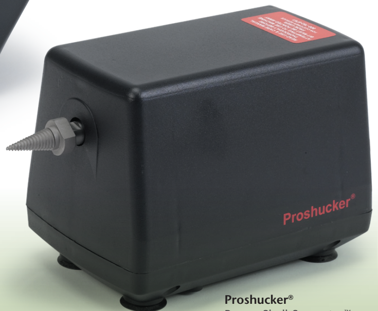
Proshucker® Power Shell Separator™