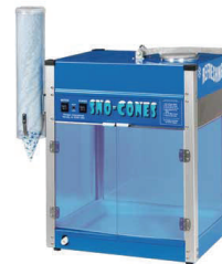
Comes with cup dispenser