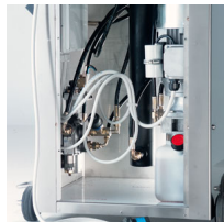
Easy access to inspect oil level and perform service