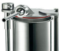
Optional stainless steel nozzle lock ring