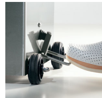
Side mounted foot switch