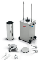
Easy and fast breakdown for cleaning

Motor: 3/4 Hp (520 W), fan cooled. Electrical: 220V AC, 60Hz, 1 phase. Plug and Cord: Attached, flexible, 3 wire (3PH+1G) SJT 12 AWG, 6'4" long cord. Switch: Stainless steel push-button keypad, IP 67 waterproof protection.