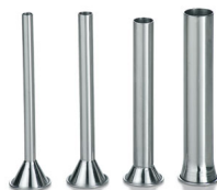
Optional stainless steel nozzles Ø 1/2" - Ø 5/8" - Ø 13/16" - Ø 1 1/2"