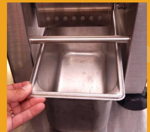
3. Finished product drops into bucket