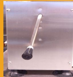
2. Rotate the handle