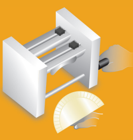
3. Finished product drops at bottom