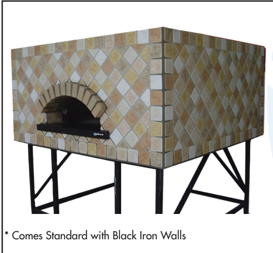
* Comes Standard with Black Iron Walls